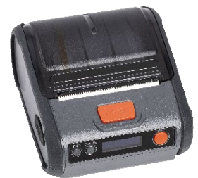
Option: wireless printer used to print the measurement results on site. Perfect solution for quick audits.