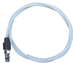
PTFE hose with quick connect