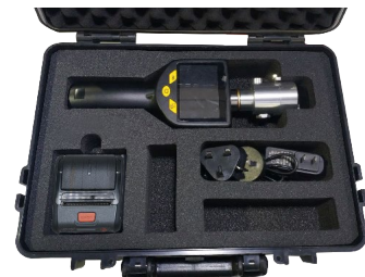
The included transport case protects the measurement instrument. At the same time it holds all accessories.