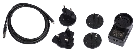
USB charger with USB-C cable